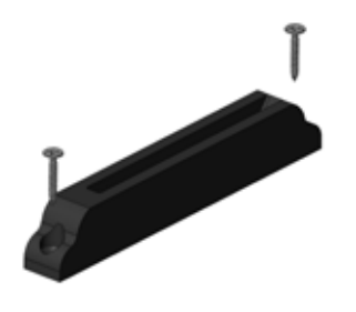
(Available in Level and Stair Options for Glass Balusters)