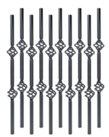
(Available for Vintage Round, Vintage Square and Mega Square)