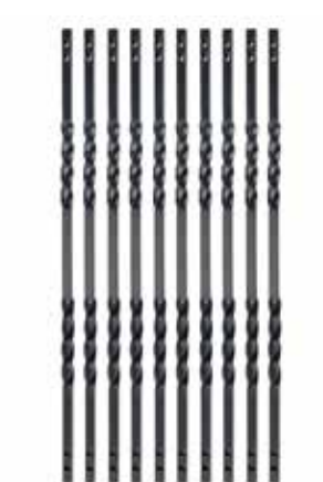
(Available for Vintage Square and Mega Square, excluding 42" option)