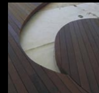
and many more