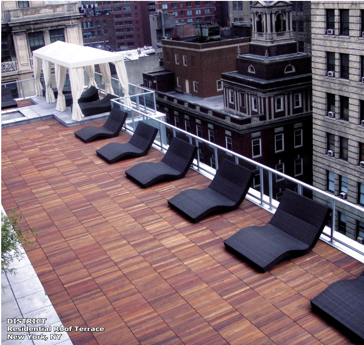
DISTRICT Residential Roof Terrace New York, NY

Design and build level decks on rooftops or any structural surface.