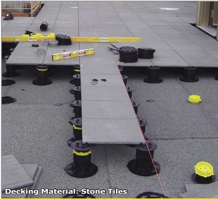
Decking Material: Stone Tiles